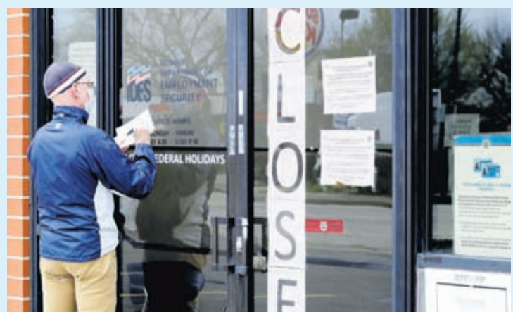
In this April 30, 2020 file photo, a man writes information in front of Illinois Department of Employment Security in Chicago.

More than half of April's job losses came from smaller companies with 500 work-